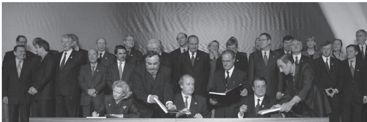
Signature of the EU Charter of Fundamental Rights, December 2000

The Charter was first proclaimed in 2000 in Nice and was then incorporated into the failed Constitutional Treaty. Sparked by the 50th anniversary of the United Nations' 1948 Universal Declaration of Human Rights, a debate began regarding the need for a catalogue of fundamental rights in the European Union. In an effort to increase the visibility of fundamental rights in the European Union through consolidation in a comprehensive document, the process leading to the development and adoption of the Charter was launched. 75 The Charter's provisions have been influenced primarily by the European Convention on Human Rights but also by the EU Treaty, European Court of Justice case law, and the constitutional traditions of the member states. The Charter is contained in a separate document from the Lisbon Treaty but remains an instrument of soft law until the Lisbon Treaty enters into force. The Lisbon Treaty will give the Charter binding legal effect by the insertion of an amendment into article 6 which results in it having the same legal value as the Treaties. Despite this absence of legal effect so far, the European Court of Justice has referred to the Charter's provisions in an ever-growing number of cases. 76 It therefore remains to be discussed whether the Charter will add any value to fundamental rights protection and the fight against racism and discrimination in the European Union.