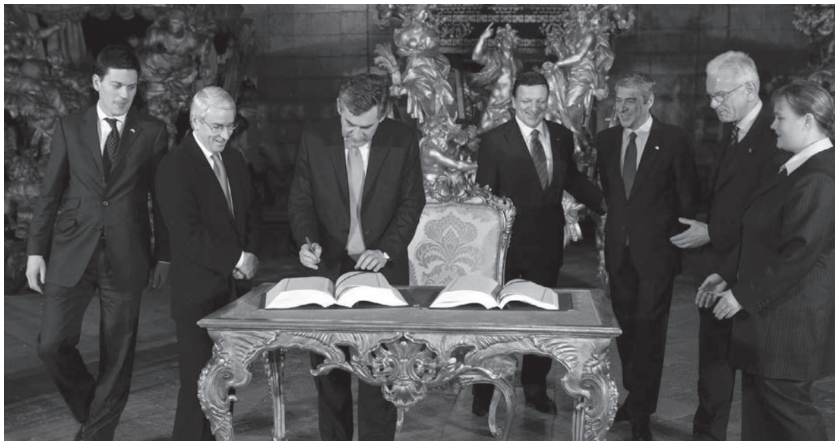
Signature of the Lisbon Treaty, December 2007

The Lisbon Treaty was signed in December 2007 by the leaders of all EU member states. It replaces the failed Constitutional Treaty 19 and amends the current Treaty on the European Union (TEU) and the Treaty establishing the European Community (TEC). The Constitutional Treaty was preceded by the Convention on the Future of Europe convened in 2002. Civil society groups played a key role during the Convention to ensure the introduction of many of the concepts which are now part of the Lisbon Treaty. Following the negative referenda in France and the Netherlands in 2005 which spelt the end of the Constitutional Treaty, an Intergovernmental Conference (IGC) was convened in 2007 which decided upon the text of the Lisbon Treaty. The negotiations on the new Treaty were largely closed to civil society groups, however, following adoption of the text there were calls for EU leaders to open up to people and NGOs to discuss the practical implementation of the new treaty provisions. 20 The Lisbon Treaty was due to come into force in January 2009. However, delays were caused by the failed referendum in Ireland in June 2008. A second Irish referendum was held on 2 October 2009,